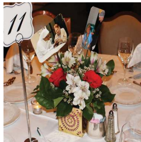
We'd like to give a big "Thank you!" to Tommy's Garden, who provides gorgeous flower arrangements like this one each year at no cost for our Annual Dinner. Donations like this keep our dinner expenses low, so more proceeds can go straight to the Home!

This year's festival is on April 27th and 28th, check it out on our website at www.rvafrenchfoodfestival.com/volunteer to see open positions and find out more!